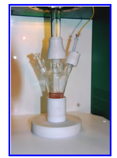
Figure 2. General setup for simultaneous US/MW irradiation.

As reported in the literature, \beta -CD forms a stable copper ion-CD inclusion complex<sup>20</sup> in which the two CD tori are