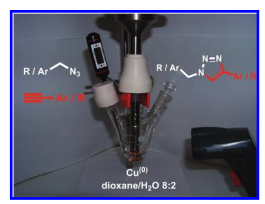
Figure 1. General reaction scheme and setup for US-promoted reaction.